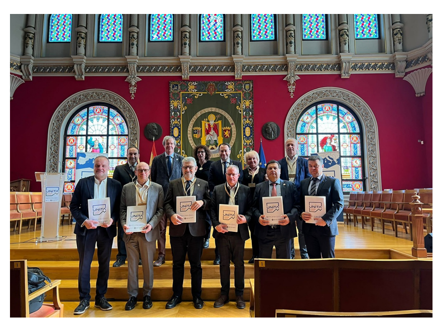
New forms of cooperation in UNITA: the signing of the EEIG and the EGAI Project

The six universities belonging to the UNITA Alliance (University of Turin, University of Savoie-Mont Blanc, University of Pau et des Pays de l'Adour, University of Zaragoza, University of Beira Interior, University of Vest din Timișoara), among the first in Europe, signed the founding act of the UNITA-Universitas Montium European Grouping of Economic Interest (EEIG) on 13 January in Turin. The main objective is to support the operation of the Alliance in the institutional missions of the universities, serving an audience of more than 165,000 students and more than 15,000 teaching and technicaladministrative staff. The EEIG will provide students and staff with excellent training and research staff with enhanced and transdisciplinary partnerships capable of promoting innovation in the territories concerned and with a European dimension.