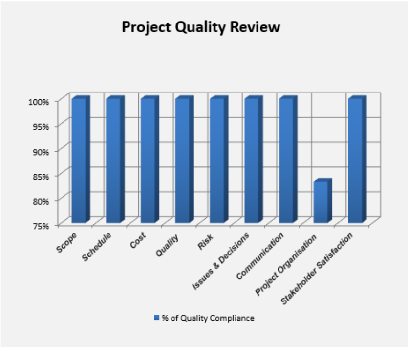
Figure 3 - Column graphic of the project domains score.